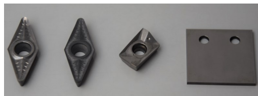
^ Hard metal cutting tools

The René Gerber AG brush polishing machines enable the processing of cutting tools made from hard materials such as PCD, ceramics and hard metal. The new generation of diamond brushes provides high precision when preparing cutting edges of tools and also permits simpler implementation of automation solutions. The perfect cut is guaranteed with these prerequisites!