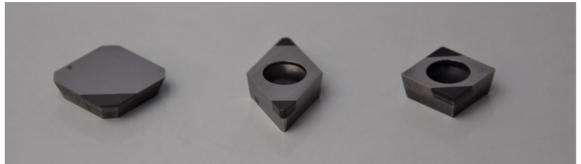
^ Cutting tools made of PCD (polycrystalline diamond)