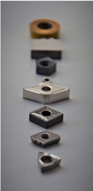
^ Hard metal parts